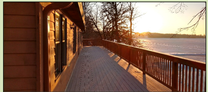
The view is beautiful from Camp's new Chalet deck!